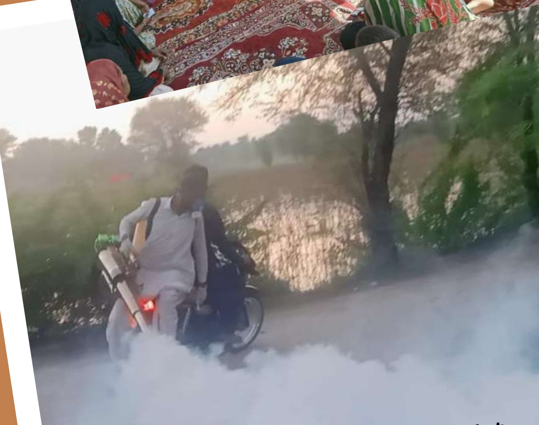
Mosquito Spray at villages- District Khairpur