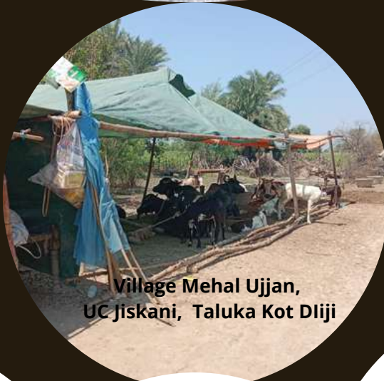
Village Mehal Ujjan, UC Jiskani, Taluka Kot Diji