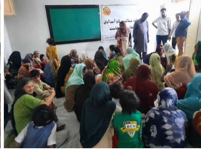
SRSO Hyderabad team distributed 30 cerelac packs, 70 nestle Bunyad milk powder of one kg pack, 100 stitches suites for women and 130 baby suites at Government Degree College Qasimabad Hyderabad