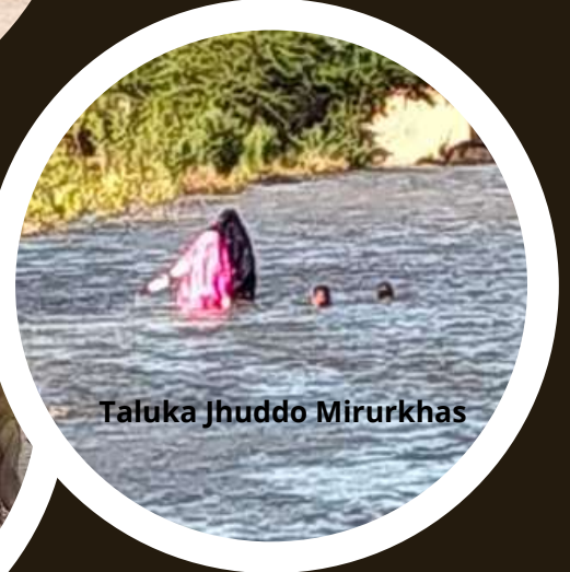
Taluka Jhuddo Mirurkhas