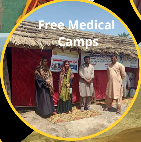
Free Medical Camps