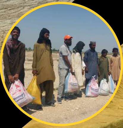
Animal Feed Distribution